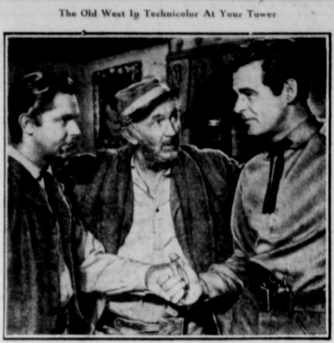
Musketeers of Wrath, Jack Buetel, Walter Brennan and Robert Ryan unite against a common enemy in "Best of the Badmen," in color by Technicolor. Along with Claire Trevor and Robert Preston, they head the cast of RKO Radio's dramatic adventure of days in the old west. This film opens Sunday for 3 days at your Tower Theatre.