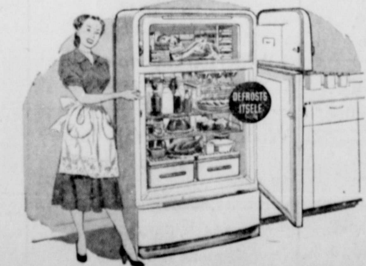
Frigidaire Imperial — 10 cu. ft. model. Separate Locker-Top holds 73 lbs. frozen food. Exclusive Refrig-a-plate gives automatic defrosting in main food compartment. Twin Hydrators hold nearly a bushel.

Come in! Ask us about the S.T.D.P. PURCHASE PLAN! Easy terms — 65 weeks to pay. Liberal allowance for your old refrigerator!