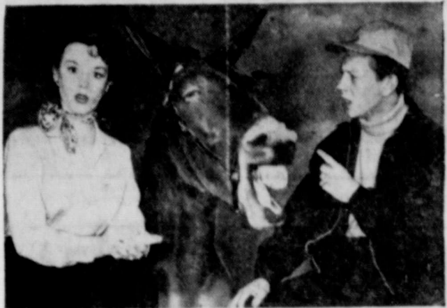
Way conversation—Piper LAURIE, FRANCIS and Donald O'CONNOR in the Universal-International hit, "FRANCIS GOES TO THE RACES."