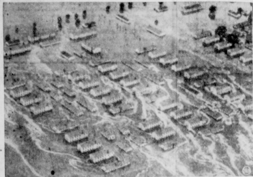
PLENTY OF SWABBING HERE —There will be plenty of swabbing to be done in these barracks at Ft. Riley, Kansas when the flood waters recede. At least 10 persons have died, and 50,000 are homeless in the worst flood in the history of Kansas.