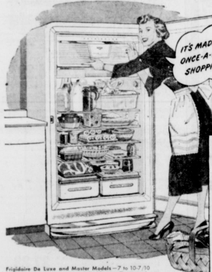
Frigidaire De Luxe and Master Models—7 to 10-7-10 cu. ft. sizes, each with full-width Super-Freezer Chest, sturdy aluminum shelves that can't rust, bin-size Hydrators.