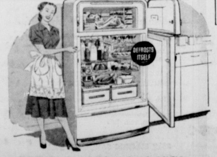
Frigidaire Imperial—10 cu. ft. model. Separate Locker-Top holds 73 lbs. frozen food. Exclusive Refrig-a-plate gives automatic defrosting in main food compartment. Twin Hydrators hold nearly a bushel.