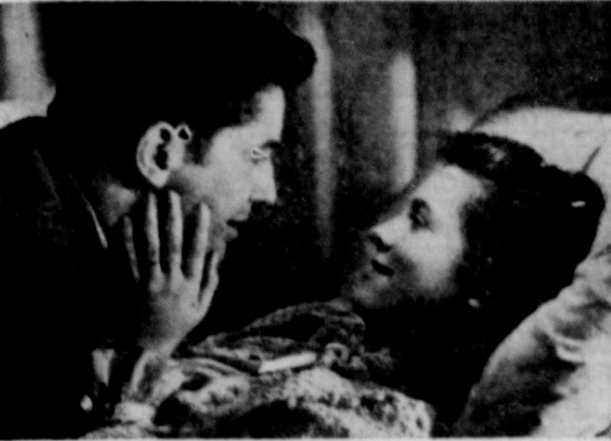
FARLEY GRANGER and CATHY O'DONNELL in a romantic scene from MGM's exciting new hit, "SIDE STREET."