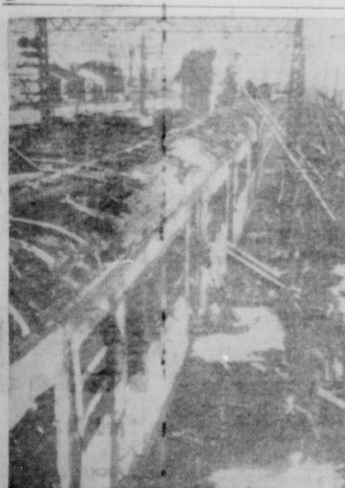
JAPANESE TRAIN CRASH TAKES 97 LIVES-Rescurers remove the charred bedies from burned out coach which was a death trap for 97 persons at Yokohama, Japan. Seven American soldiers were among the dead