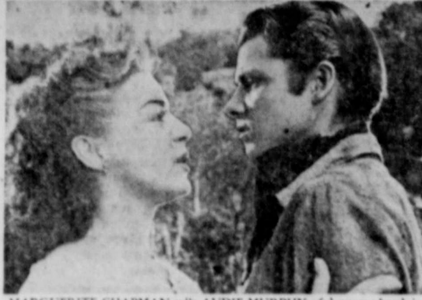
MARGUERITE CHAPMAN with AUDIE MURPHY of dangers ahead, in Universal-International's 'KANSAS RAIDERS', in color by Technicolor.