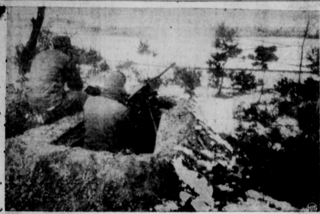
THEY WATCH FOR THE ENEMY—A machine gun crew, dug into protected position on hillside in South Korea, scans terraine for signs of enemy activity. Communist forces.neared Chungju in a flanking drive against the 8th Army. (NEA Telephoto).