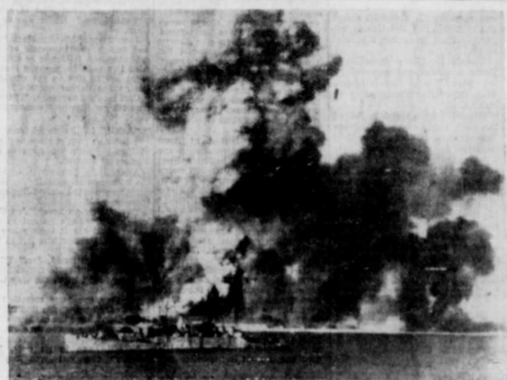
HUNGNAM BEACH LEFT ABLAZE—As the last transport pulled out of Hungnam harbor, carrying the last of the United Nations forces, the beachhead was blasted by detonations.

AUSTIN, TEX., Dec. 27 (UP)—Cash value of Texas farm crops in 1950 topped the billion dollar mark for the fourth consecutive year but dropped about 22 per cent from last year's record-high, the U. S. department of agriculture reported today. The figure was exclusive of livestock, poultry and dairy products.