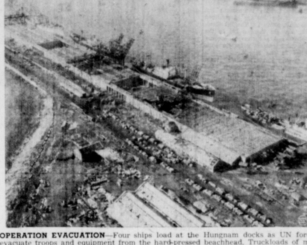
OPERATION EVACUATION-Four ships load at the Hungnam docks as UN forces evacuate troops and equipment from the hard-pressed beachhead. Truckloads of men and material jam the roads at the dockside. Staff Walton H. Walker last Saturday a continuing movement of Com-