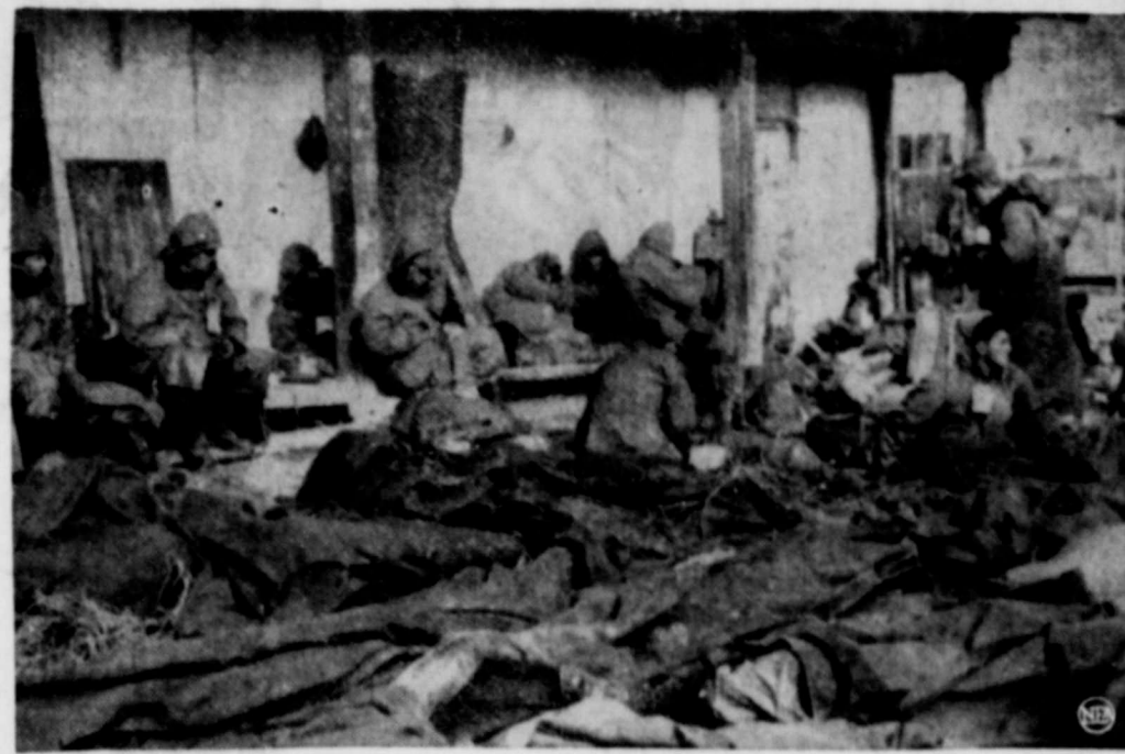
WOUNDED MARINES WAIT FOR TRANSPORTATION—Wounded and frost-bitten Marines in the Hungna marea lie on straw rest on porch of building while patiently waiting for transportation to hospitals.

LAREDO, Dec. 16 (UP)—Ambassador William O'Dwyer's aid was sought today in securing lumber export-import business for this border town.