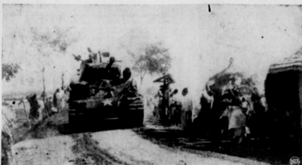
NORTH KOREANS CHEER ADVANCING UN FORCES —United Nations tank spearheads drive toward the Manchurian border, rolling through one small village after another in the northwest sector of Korea. Here, local populace come out to cheer GI's as they go through.

They were picked up by police on a complaint but were released without charges.