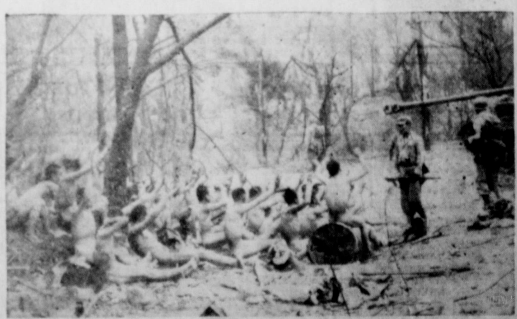
CAPTURED NORTH KOREANS STRIPPED OF CLOTHING—Stripped of their clothing captured North Koreans are guarded by Marines following the invasion of Inchon, port city for Seoul. More than 1000 prisoners have been taken in the few days of fighting since the amphibious landings.

PHILIPPINE TROOPS ARRIVE 8TH ARMY HEADQUARTERS, Korea, Sept. 19 (UP)—A contingent of Philippine Army troops has arrived in Korea, A U. S. Army spokesman disclosed today. He refused to disclose the size of the contingent or when and where it would be committed.