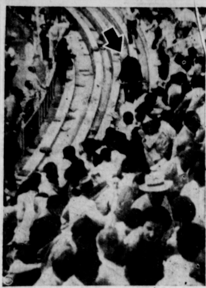
BULL FIGHTS MAN—Spectators scatter as a bull invades the stands at Malaga, Spain. Several were injured before frantic officials again attracted it to the ring, where he finally was slain in traditional Spanish fashion.