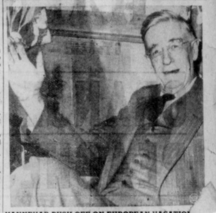
VANNEVAR BUSH OFF ON EUROPEAN VACATION Vannevar Bush, noted atomic scientist and president of the Carnegie Institute, waves goodbye as he leaves New York aboard the Queen Elizabeth. Dr. Bush, who will be given a Doctor's degree at Cambridge University in England, is on vacation.