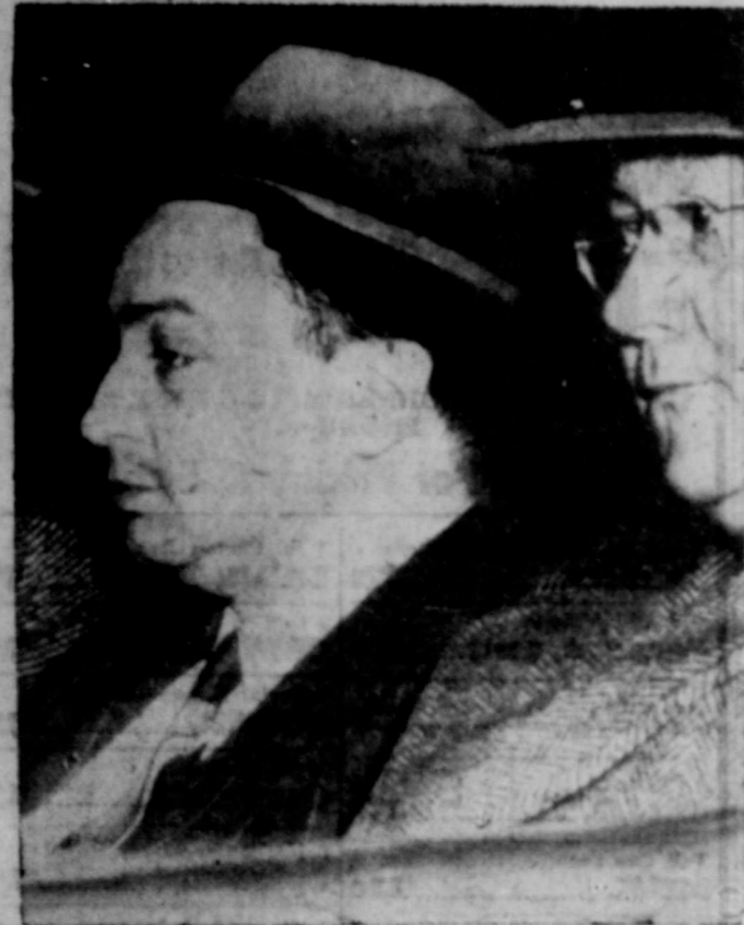
FBI ARRESTS ATOMIC SPY —Flanked by FBI agents in Philadelphia, Henry Gold, left, is driven to prison after his arraignment on charges of atomic espionage in connection with the Dr. Klaus Fuchs case. Bail was set at $100,000.