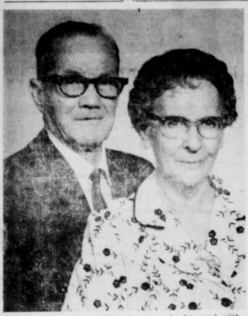
be honored with