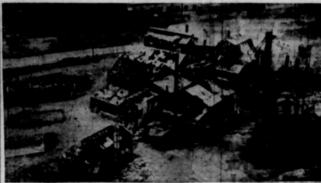
CHEMICAL PLANT SHATTERED—Aerial view shows how buildings of the American Agricultural Chemical Company's plant at South Amboy, N. J., were blasted by explosion of munitions-laden barges. Damage there was estimated at $3,000,000 with total damage in the disaster expected to exceed $10,000,000.