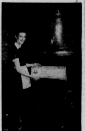
This smiling Philadelphia waitress stopped in on her lunch hour to visit the Liberty Bell at Independence Hall. She was just in time to have her picture taken with the twin symbols of the Treasury Department's Independence Savings Bond Drive—the Liberty Bell and a U. S. Savings Bond.

The new drive to be held May 15 to July 4, urges Americans in all walks of life to save for future financial independence by buying Savings Bonds regularly.