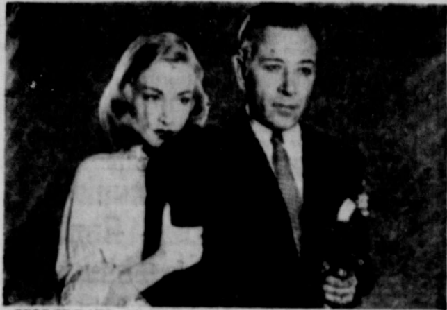
GEORGE RAFT with NINA FOCH holds a gun on would-be attackers in this scene from Columbia's "JOHNNY ALLEGRO."