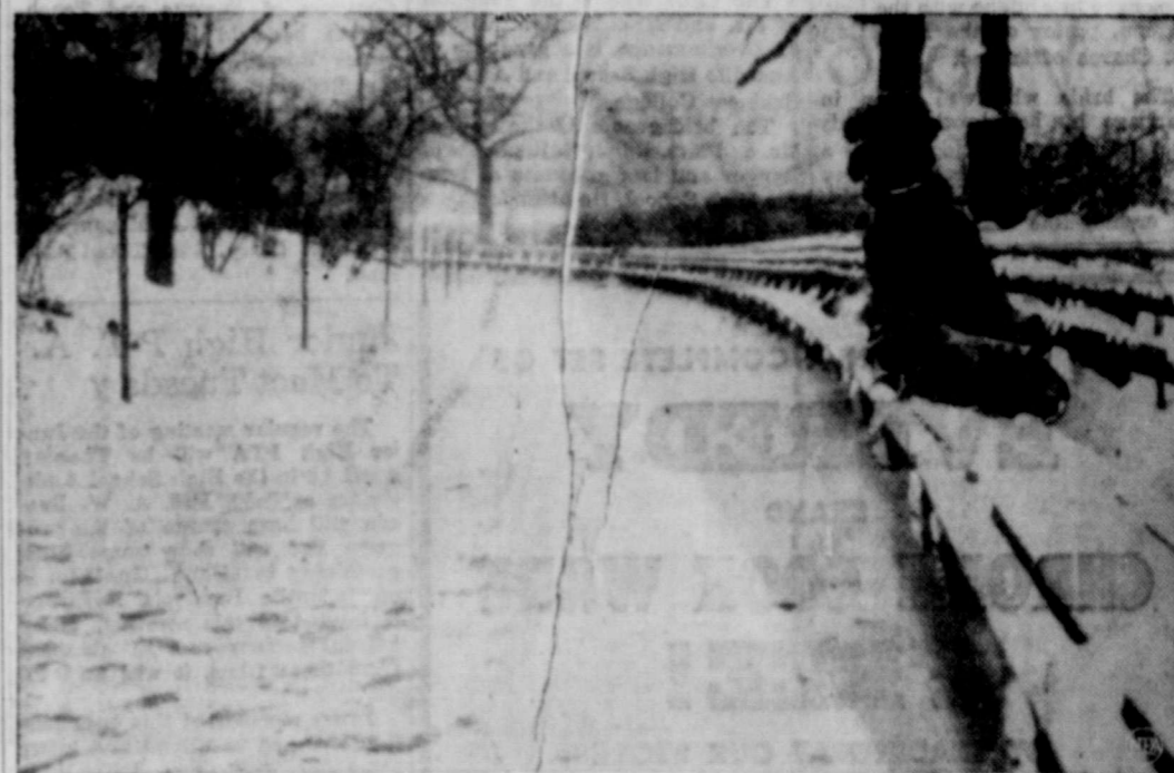
Brillo, a French poodle, and Schatzi, a dachshund, contemplate a spring (?) day not fit for man nor beast as a heavy snow storm swept over New York.