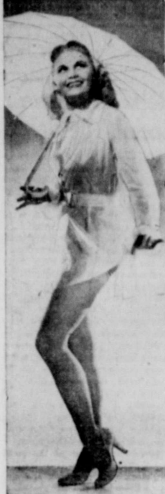
LET IT RAIN —Hollywood's Joan Caulfield is pretty as a rainbow and ready for April showers in this abbreviated rain outfit that she wears in a new musical picture.