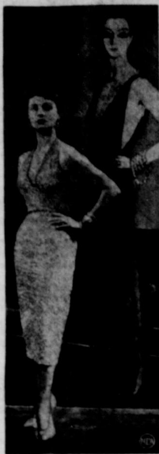
FLAPPER'S RETURN —Some "new" spring styles look an awful lot like the flapper fashions worn in the Twenties and laughed at in the Thirties. Parisian artist Van Longen's portrait of a 1920 belle is almost duplicated by the model wearing the latest Jacques Fath short-skirted evening gown.