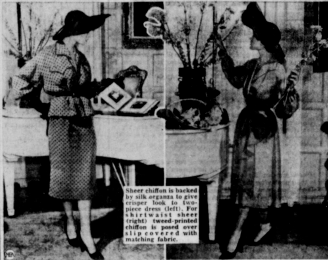
Sheer chiffon is backed by silk organza to give crispier look to two-piece dress (left). For shirtwaist sheer (right) tweed-printed chiffon is posed over slip covered with matching fabric.