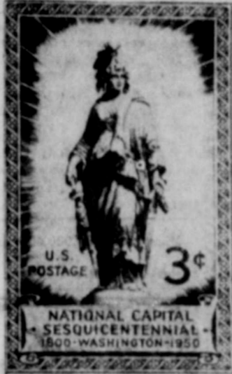
FREEDOM'S STAMP —This is the Freedom National Capital Sesquicentennial commemorative stamp which will be placed on sale in Washington, April 20. The design shows the statue of freedom which surmounts the dome of the capitol.

Of the 1949 Illinois apple crop of 4,176,000 bushels, one half graded No. 1.