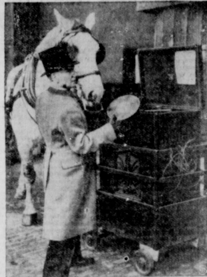
DISK JOCKEY—The chief coachman of Buckingham Palace prepares to play march music to accustom Cunningham, one of the royal horses, to the stirring airs that will mark formal parades to the opening of British Parliament March 6.