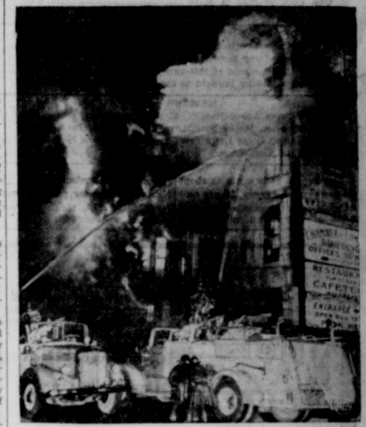
A general alarm fire in downtown Boston caused over a million dollars worth of damage and threatened the whole main business district before firemen brought it under control.