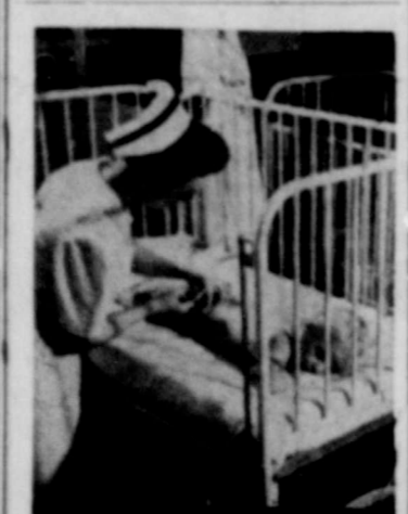
NURSING CARE The Red Cross trained 126,894 persons in home nursing in 1949; in disaster and epidemic areas you find the Red Cross nurse. —GIVE TO THE RED CROSS—

he would "stand by my wife" during the trial. He has been studying voice in Boston.