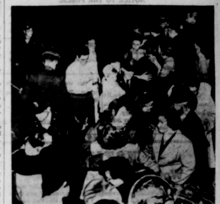
Crewmen rescued after ditching their B-36 off British Columbia were given a riotous welcome by wives, relatives and friends as they arrived back at Carswell Air Base, Fort Worth, Tex., in their crippled C-54 transport. Photo shows scene on ramp as survivors alighted.