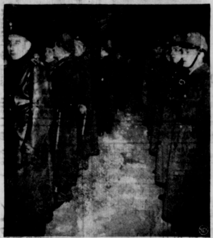
BERLIN BUFFER-Russian-controlled German police on the left and West Berlin police on the right form a double line at a Berlin zonal boundary to protect Gerhard Eisler, East German propaganda chief, from a group of hostile anti-Reds as he spoke at a Communist rally. After Eisler's speech, some excited Communists attempted to break through the police buffer, but dispersed after a 30-minute scuffle.

Now there's a can stretcher simplify thinning and coloring of paints. A metal extender fits ino a gallon paint can, reports The American Magazine, and not only dds an extra one-third capacity out allows freedom of manipulation without spilling or the need of