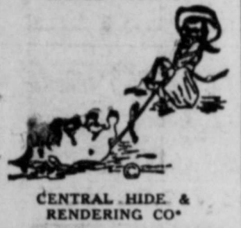
CENTRAL HIDE & RENDERING CO.

Your Local USED-COW Dealer Removes Dead Stock FREE For Immediate Service PHONE 53 COLLECT RANGER TEXAS