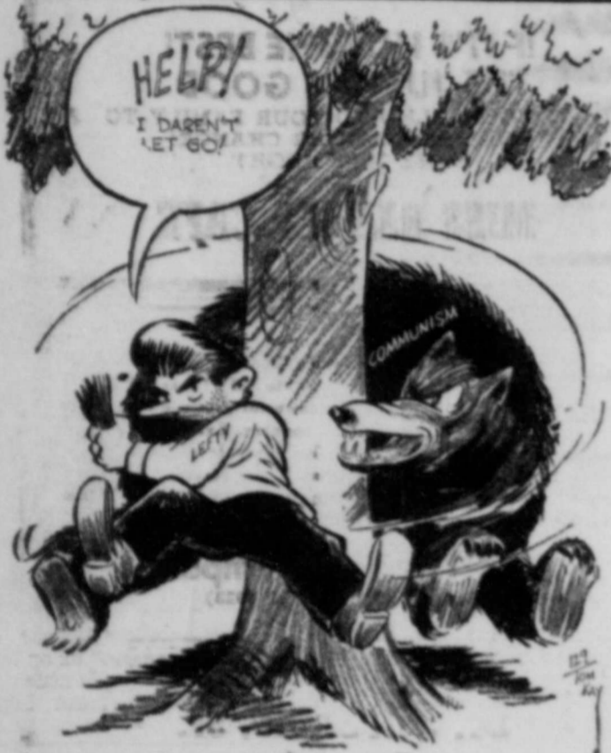
A Bear, Not A Bull, By The Tail