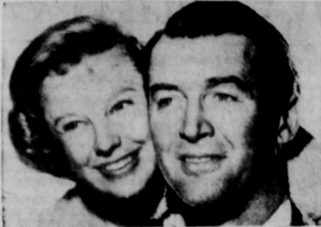
JUNE ALLYSON and JAMES STEWART pictured romantically in this scene from MGM's "THE STRATTON STORY."