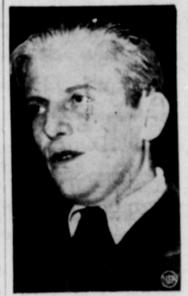
ON TRIAL—Otto Abetz, wartime Nazi boss in Occupied France, is on trial by a French Military Tribunal in Paris, where he held sway for more than three years as Hitler's personal representative.