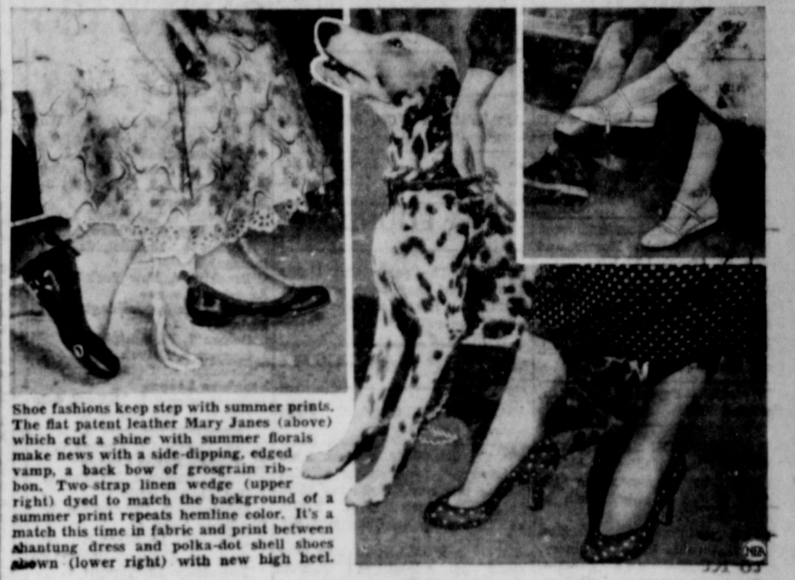
Shoe fashions keep step with summer prints. The flat patent leather Mary Janes (above) which cut a shine with summer florals make news with a side-dipping, edged vamp, a back bow of grosgrain ribbon. Two-strap linen wedge (upper right) dyed to match the background of a summer print repeats hemline color. It's a match this time in fabric and print between slanting dress and polka-dot shell shoes shown (lower right) with new high heel.