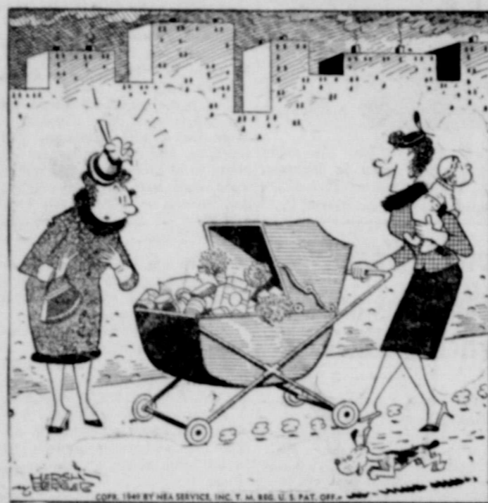
"It's easier to carry him than the groceries!"