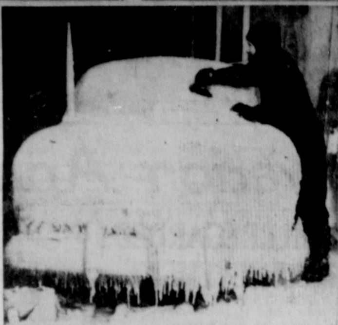
WHO'S HOT? —If you're sweltering in a June heat wave, this ought to be a sight for your tired eyes. This engineer is testing cold-weather starting under ice and sleet conditions on a new car at the Ford plant in Dearborn, Mich. The temperature in the wind tunnel is 30 degrees with a 60-mph gale.

MEMBER United Press Association, N. E. A. Newspaper Feature and Association, Texas Daily Press League, Southern Newspaper Publishers Association.