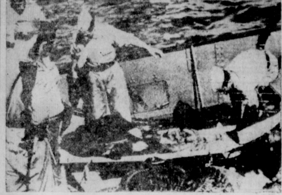
Rescue workers bring ashore one of the victims of a Dutch Airlines plane crash at Bari, Italy. Thousands of spectators watched in horror as the plane crashed into the water from 15,000 feet. Thirty-two bodies have been recovered.