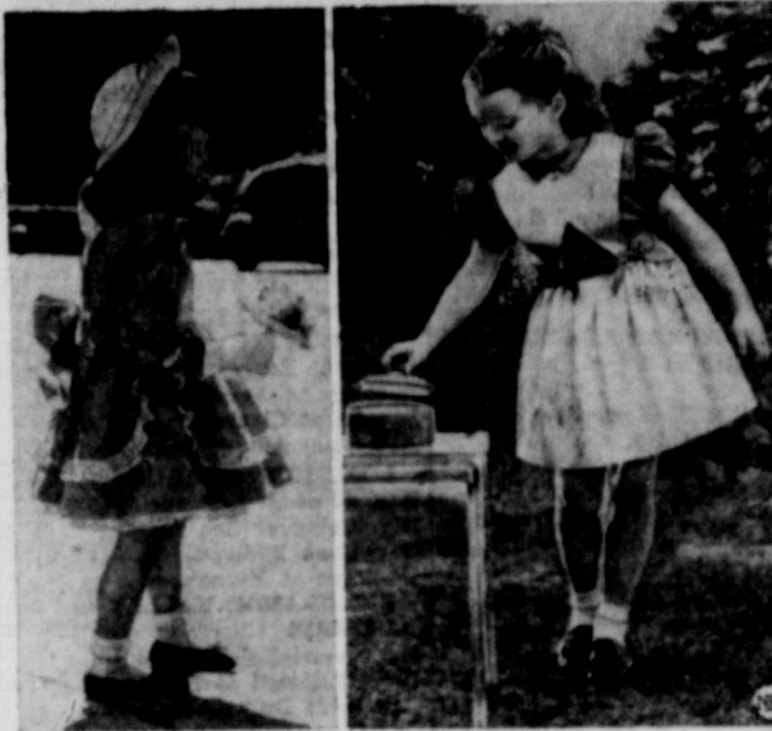
Little girls take to Victorian fashions just as grownups do. The tiny party-goer (left) wears a 19th Century inspired dress of pastel cotton, eyelet ruffled over and under the full bow-tied skirt. Gigi Perreau, diminutive movie star (right) sets the style for a revival fashion of primer-school pinafores. The grey cut-away bib ties to matching dress skirt over the royal blue puffed sleeve blouse.

From this style source comes a pink cotton poplin dress iced to look as edible as a birthday cake with white eyelet ruffles. These run apron-wise on a bow-tied skirt and peep beneath the hemline. A two-toned gray and royal blue cotton dress of Jack Borgenicht's design revives the Victorian pinafore. Over a blouse of royal blue a front cutaway bib of gray fabric is bow-tied to a skirt of matching color. Although this ready-to-wear design was created for Gigi Perreau, 7-year-old movie star, it's available to off-stage charmers.