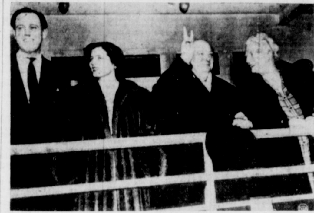
Winston Churchill, wartime Prime Minister of Great Britain, makes his famous "V" for victory sign on his arrival in New York aboard the Queen Elizabeth. From left to right, are: Capt. Christopher Soames, Churchill's son-in-law; his daughter Mary; and Mrs. Churchill.