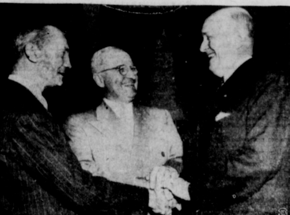
President Truman joins in a three-way handshake with his outgoing Secretary of Defense, James Forrestal, left, and his incoming Secretary, Louis A. Johnson, right.