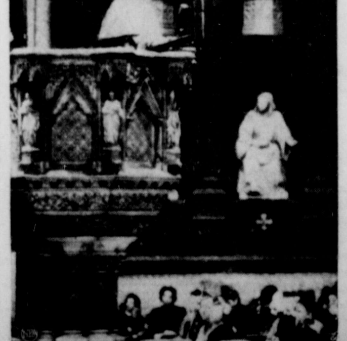
Speaking from the pulpit of St. Patrick's Cathedral, Francis Cardinal Spellman, Archbishop of New York, denounced the Communists at a solemn high mass, the mass was in observance of "Cardinal Mindszenty Day."