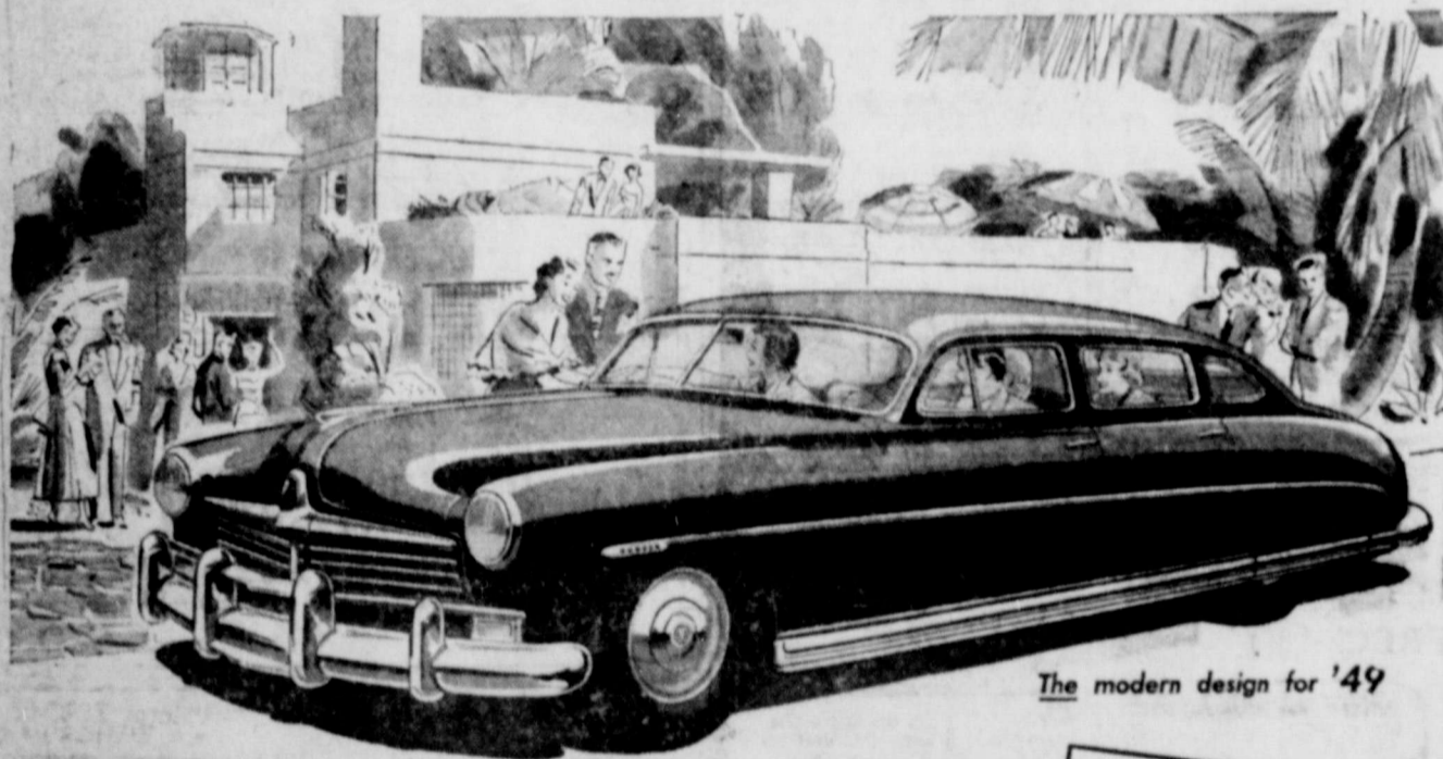
The modern design for '49

The New Hudson—the first and only car you step down into—achieves true streamlining and today's lowest silhouette as the natural result of a basically new design principle available in no other type of automobile!