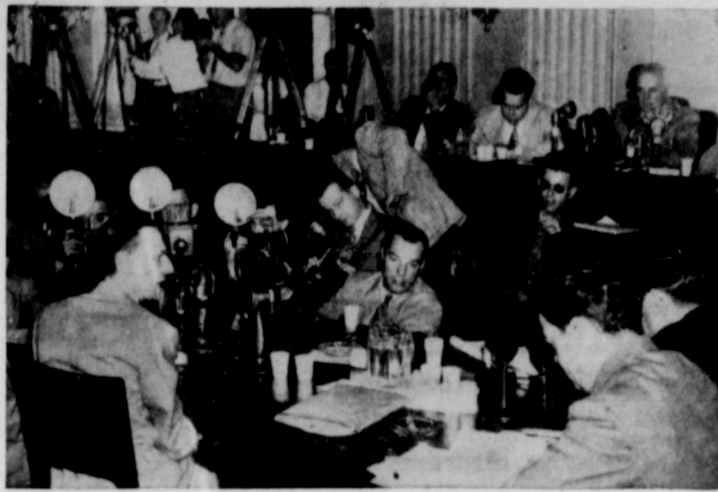
Victor Perlo, left, accused by Elizabeth Bentley as being the head of a wartime Soviet spy ring operating in Washington, faced barrage of cameramen as he appeared before the House Un-American Activities in Washington. Committee members are Chairman J. Parnell Thomas, top right, and Representative Richard Nixon, at Thomas' right.