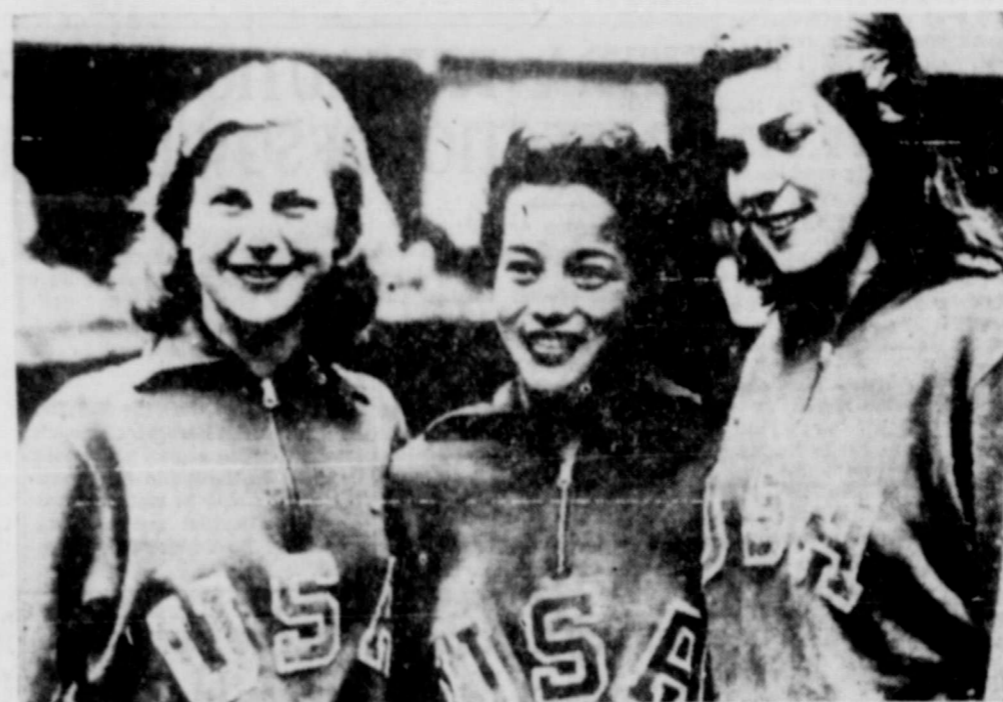
The three U. S. stars who placed 1-2-3 in the Olympic women's springboard diving event in London. From left to right, are: Zoë Ann Olsen, who won second; Vicki Manalo Draves, first, and Patricia Elsener, third. All three girls are from California.