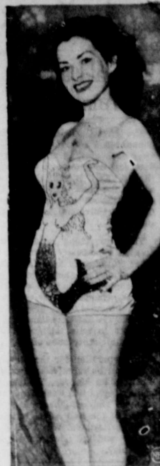
A mermaid, outlined in glittering, rainbow-colored sequins makes an unusual decorator for this strapless white swim suit. The sprite-trimmed suit is modeled by Colleen Delaney, at Miami, Fla.