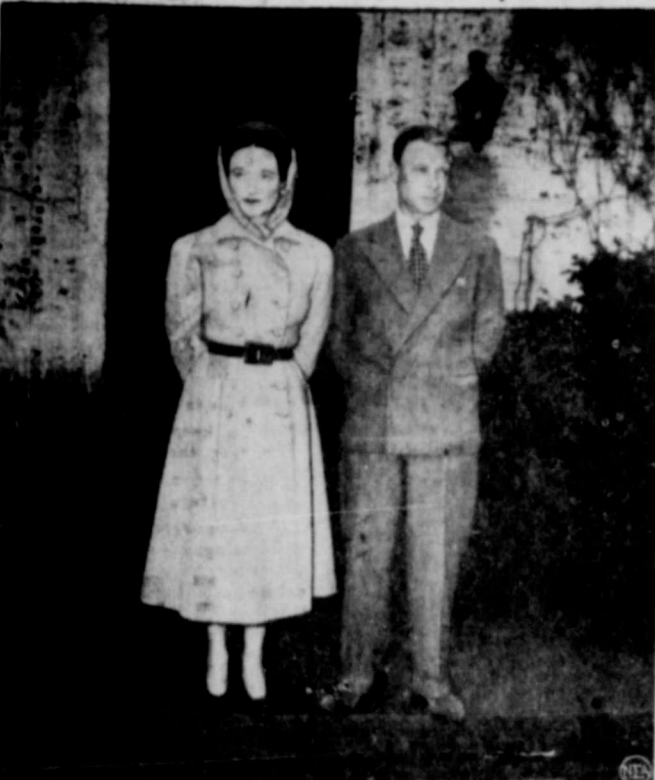
Posing in front of their new home on Horse Hollow Road, Locust Valley, Long Island, N. Y., the Duke and Duchess of Windsor make their first appearance as New York suburbanites. The Windsors, who moved in with 20 servants, are renting the dwelling, known as Severn. It's a French provincial chateau, complete with 56 acres.