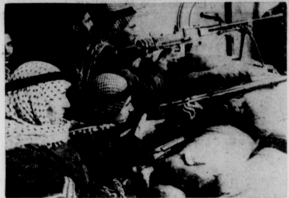
An aged Arab woman, a sergeant in the Arab equivalent to a civilian defense force, joins the men in battle against the Jews inside Jaffa Gate of the Old City in Jerusalem. This is one of the first pictures of an Arab woman taking an active part in the Palestine fighting.