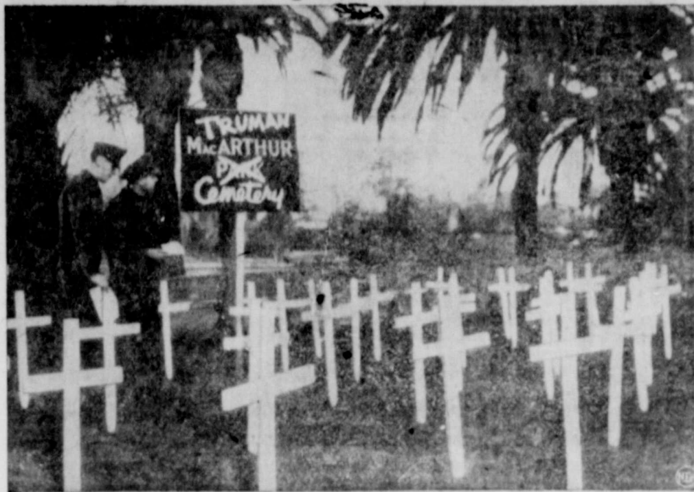
MacArthur Park, in downtown Los Angeles, was converted into a mock cemetery by vandals, protesting the possible presidential candidacy of Gen. Douglas MacArthur. The sign was repainted to read "Truman-MacArthur Cemetery," and 70 wooden crosses were stuck in the park's lawn.