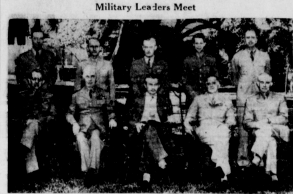
Military Leaders Meet