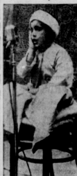
Prepped up on pillows to reach the microphone, a 5-year-old Cairo kindergarten pupil recites verses by memory from the Koran, Holy Book of Islam, during the annual celebration of the birth of Mohammed. The boy is in sheik garb for the occasion.