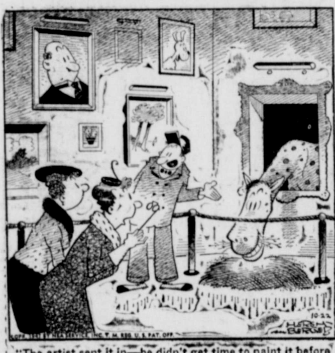
The artist sent it in—he didn't get time to paint it before the exhibition!