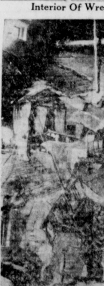
An interior view of the damage in the antiquated Empire Apartment building in Washington, D. C. when all of its seven floors collapsed. This photo shows the second, third, and fourth floors of the building which housed about 150 tenants. Latest reports list one dead and 13 injured with firemen still searching for possible victims in the debris. (NEA Telephoto).