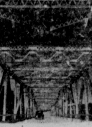
Right is headon view of the new bridge.

were among the shoppers Saturday in Rising Star.