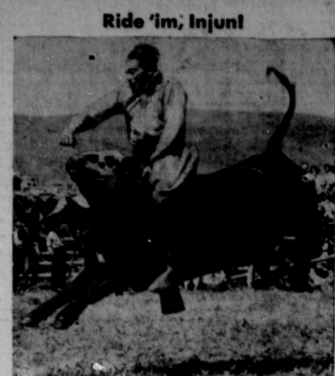
Ride 'em, Injuni

Free of fancy trimmings, Canada's Stoney Indians stage their own version of life on the range. As many as 30,000 turn out to see wild west shows in a natural setting on Morley reservation. Winners get only cowboy equipment. This steer has none the best of this bareback rider—yet.