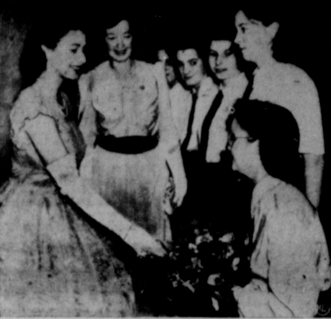
At a ball in Edinburgh, Scotland, Princess Elizabeth receives a bouquet from one of the seven members of the Edinburgh Girls' Clubs who were presented to her. The heiress, presumptive to the throne of England was accompanied, at the ball, by her family and fiance, Lt. Philip Mountbatten.