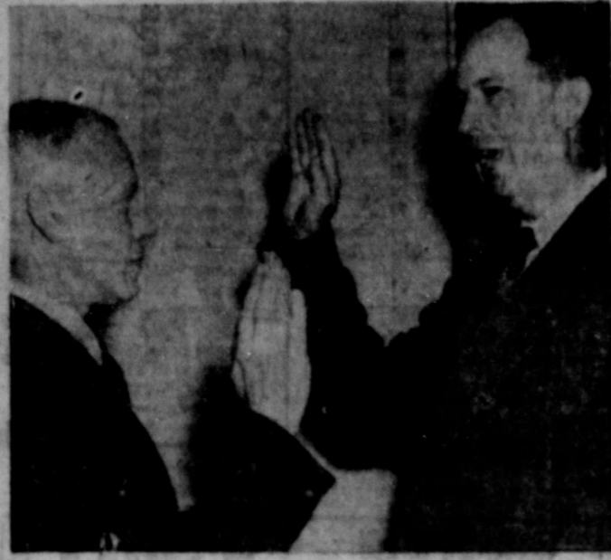
Kenneth C. Royall, right, is sworn in as the new Secretary of War by retiring Secretary Robert Patterson, left, during ceremonies at the Pentagon Building in Washington.