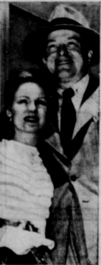
Far-away smiles of screen players Virginia Mayo and Michael O'Shea are in contemplation of their wedding July 5 in the Little Church of the Flowers at Glendale, Calif.--and a weekend honeymoon before her start on the picture "That's Life."

school and college teachers, the winners being selected by competitive tests. Each is for $500 and is provided so that the winners may become certified pilots, or if already holding that rating so that they may receive further flight training. The teachers are cooperating in the Air Education program of the Michigan Department of Education which is integrating aviation subjects into standard academic courses. The Civil Aeronautics Administration is aiding the State Department of Education in setting up its Aviation Program.