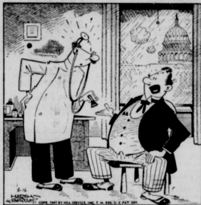
"What can you do for me, doctor? I'm getting so I believe my own speeches!"