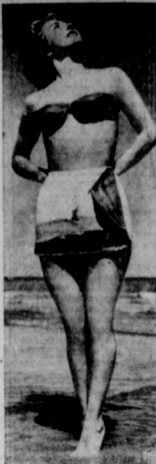
A seascape in red, white, and blue, complete with a sailboat for realism, distinguishes this short-skirted bathing ensemble from Paris. The outfit is of linen, with blue strapless bra.