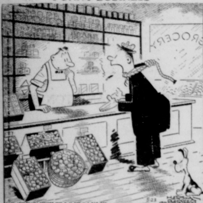
"Strings around my finger didn't do any good, so the wife thought of this!"