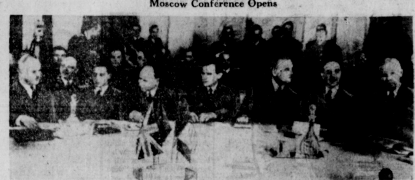
Moscow Conference Opens

WASHINGTON — President Truman won powerful Republican support today in his campaign against a general increase in rent ceilings.