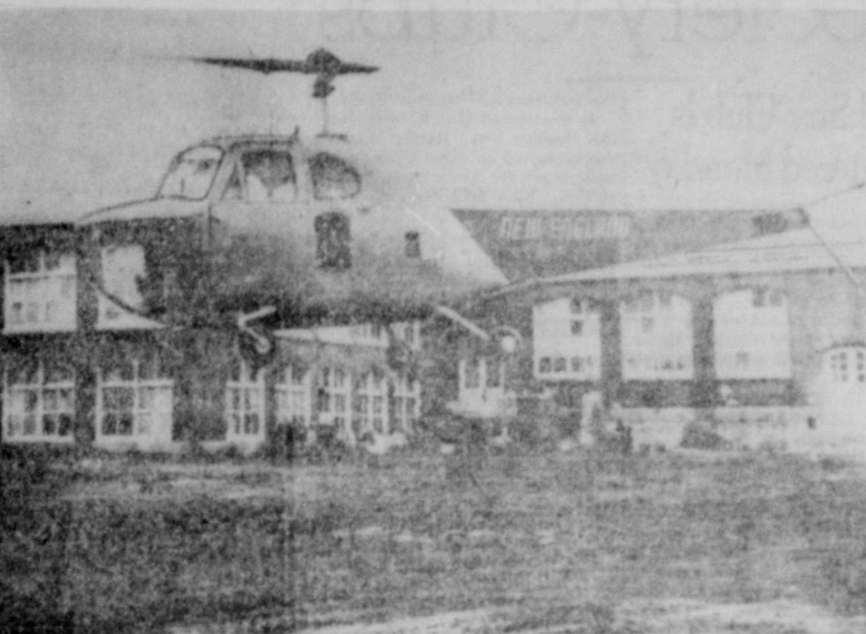
A helicopter is being used to foil pickets at the Cornell-Dubilier Corporation plant in New Bedford, Mass., which is being picketed by striking truck drivers. The plane is being used to deliver supplies to the plant and the management says that deliveries out of the plant will be made by air if the strike is not ended.