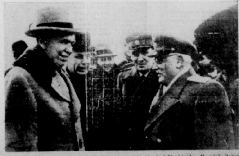
Secretary of State George C. Marshall is greeted by Andrei Vishinsky, Russia's deputy foreign minister, after his arrival in Moscow for the Big Four Conference.

Temperature at 1:30 p.m. today Maximum _____ 54 Minimum _____ 44 Hour's Reading _____ 54 Temperature for the last 24 hours ending at 8:00 a.m. today. Maximum _____ 44 Minimum _____ 35