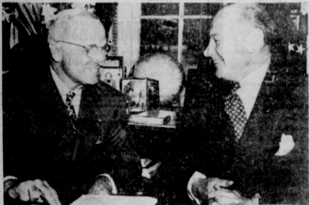
President Truman, left, conferred for more than an hour with Lewis W. Douglas at the White House, just before the latter was sworn in as the U. S. Ambassador to Great Britain.

Truman Confers With New Ambassador of Britain