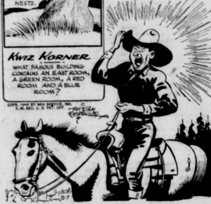
ANSWER: The White House.

YIPPEE-KI-YOING AT CATTLE NOW IS BANNED BY SOME MODERN RANCHERS, WHO SAY IT'S HARD ON THE ANIMALS' NERVES, THUS DELAYING THE FATTENING PROCESS.