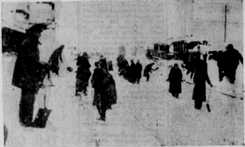
German prisoners of war working in bitter cold at Dunford Bridge, Yorkshire, England, clear the railroad tracks of snow after blizzards isolated this and other villages in the worst winter England has had for years.